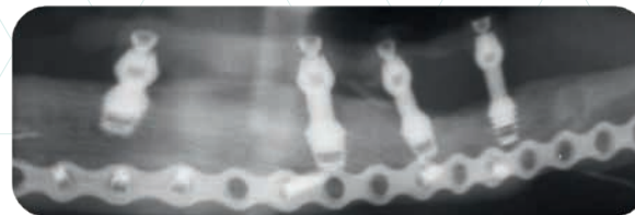
Transformation of bone after 10.5 years loading